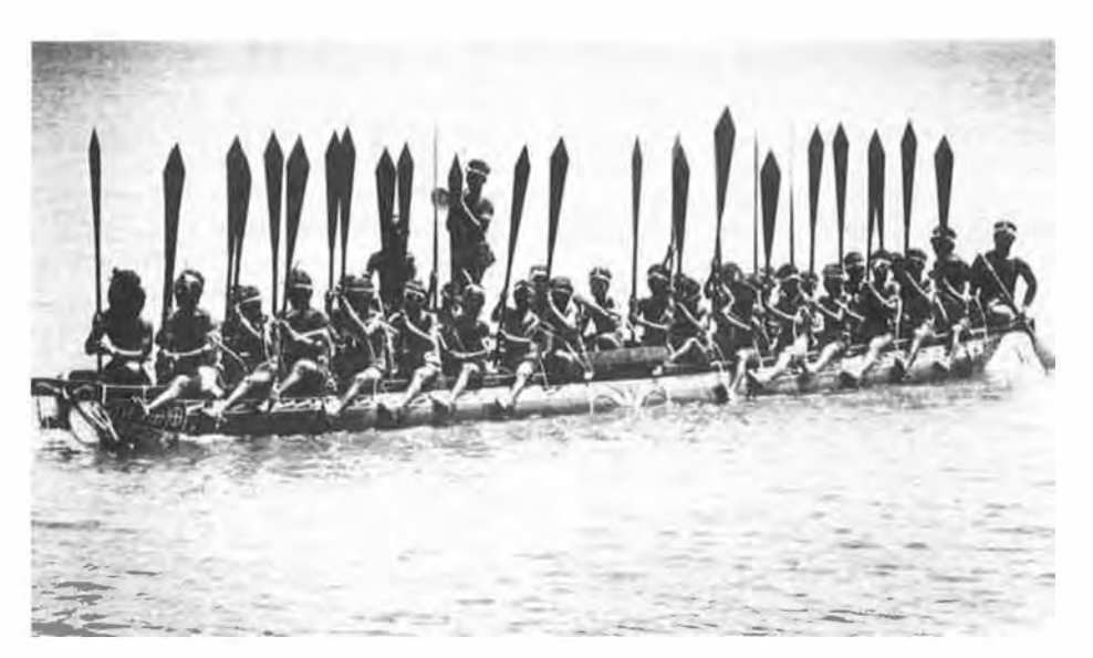
Some traditional cultural properties may be moveable, like this traditional war canoe still in use in the Republic of Palau.

consideration is relevant but rarely applied formally to traditional cultural properties; in most cases the property in question is a site or district which cannot be relocated in any event. Even where the property can be relocated, maintaining it on its original site is often crucial to maintaining its importance in traditional culture, and if it has been moved, most traditional authorities would regard its significance as lost.