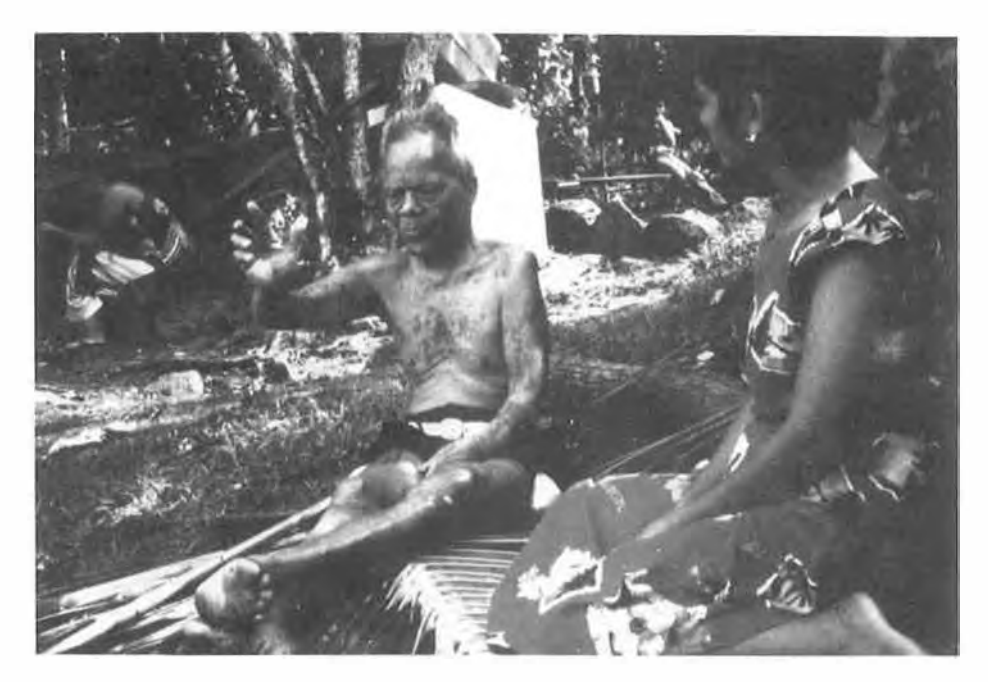
Much of the significance of traditional cultural properties can be learned only from the testimony of the traditional people who value them, like this old man being interviewed in Truk.