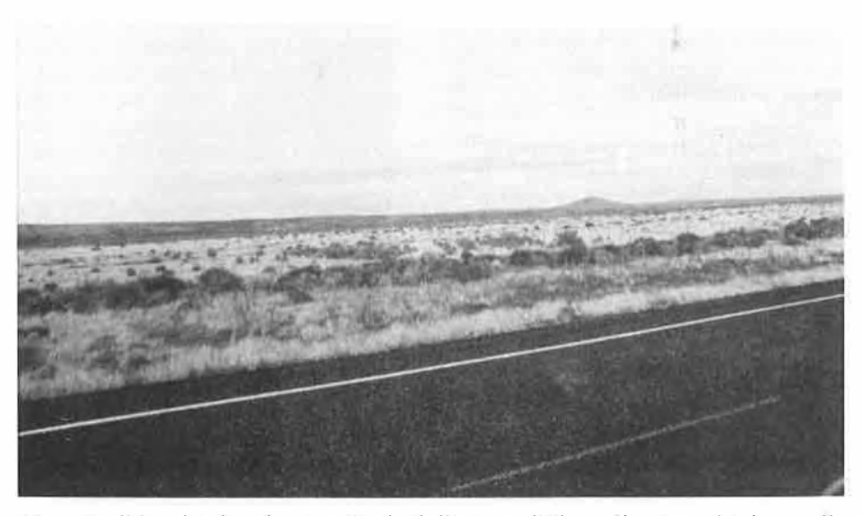
Many traditional cultural properties look like very little on the ground. The small protuberance in the center of this photo, known to residents of the Hanford Nuclear Reservation in Washington State as Goose Egg Hill , is regarded by the Yakima Indians of the area as the heart of a goddess who was torn apart by jealous compatriots. They scattered her pieces across the landscape, creating a whole complex of culturally significant landforms.

A property may be regarded as representative of a significant and distinguishable entity, even though it lacks individual distinction, if it represents or is an integral part of a larger entity of traditional cultural importance. The larger entity may, and usually does, possess both tangible and intangible components. For example, certain locations along the Russian River in California are highly valued by the Pomo Indians, and have been for centuries, as sources of high quality sedge roots needed in the construction of the Pomo's world famous basketry. Although the sedge fields themselves are virtually indistinguishable from the surrounding landscape, and certainly indistinguishable by the untrained observer from other sedge fields that produce lower quality roots, they are representative of, and vital to, the larger entity of Pomo basketmaking. Similarly, some deeply venerated landmarks in Micronesia are natural features, such as rock outcrops and groves of trees; these are indistinguishable visually (at least to the outside observer) from other rocks and trees, but they figure importantly in chants embodying traditional sailing directions and lessons about traditional history. As individual objects