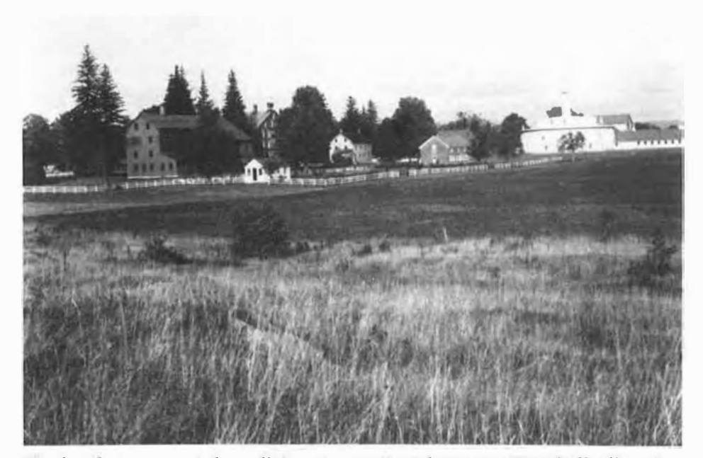
The fact that a property has religious connotations does not automatically disqualify it for inclusion in the National Register. This Shaker community in Massachusetts, for example, while religious in orientation, is included in the Register because it expresses the cultural values of the Shakers as a society. (Historic American Buildings Survey)