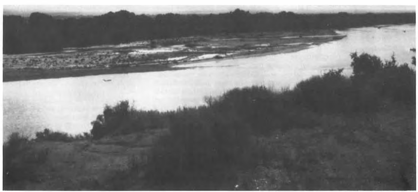
These sandbars in the Rio Grande River are eligible for inclusion in the National Register because they have been used for generations by the people of Sandia Pueblo for rituals involving immersion in the river's waters. (Thomas F. King)