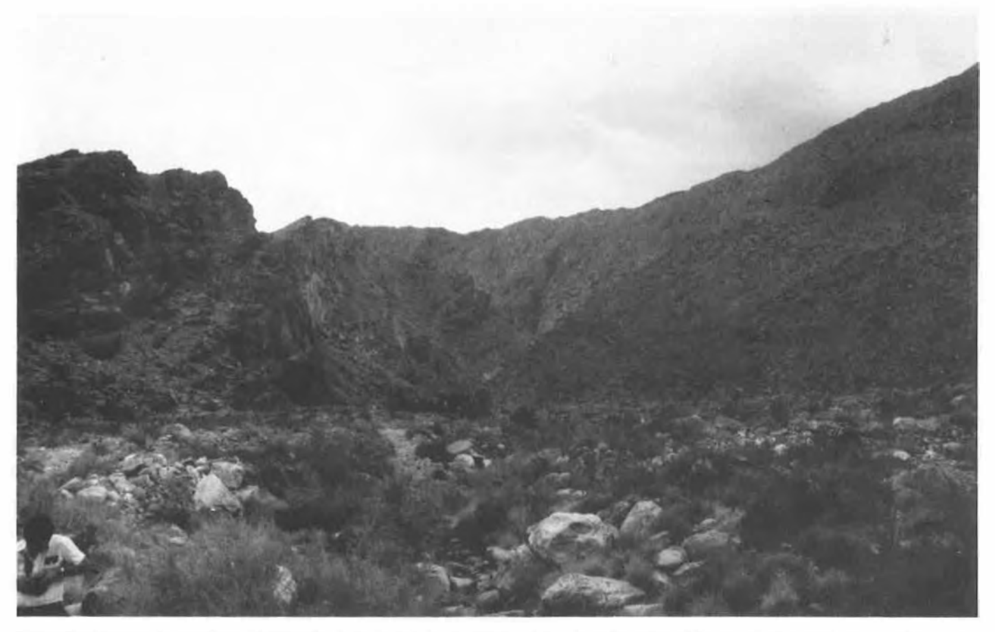
Tahquitz Canyon, in southern California, is included in the National Register because of its association with the traditions of the Cahuilla Indians. The ancestors of the Cahuilla came into this world from a lower one at the beginning of time, and an evil spirit, named Tahquitz, is believed to live in the upper reaches of the canyon.

years, or if it was used by members of the tribe in prehistory or early history, it may be eligible, but if its use has begun only within the last 50 years, it is probably not eligible.