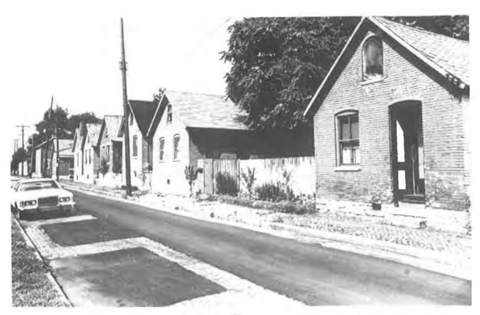
The German Village Historic District in Columbus, Ohio, reflects the ethnic heritage of 19th century German immigrants. The neighborhood includes many simple vernacular brick cottages with gable roofs. (Christopher Cline)

preserving and conserving the intangible elements of our cultural