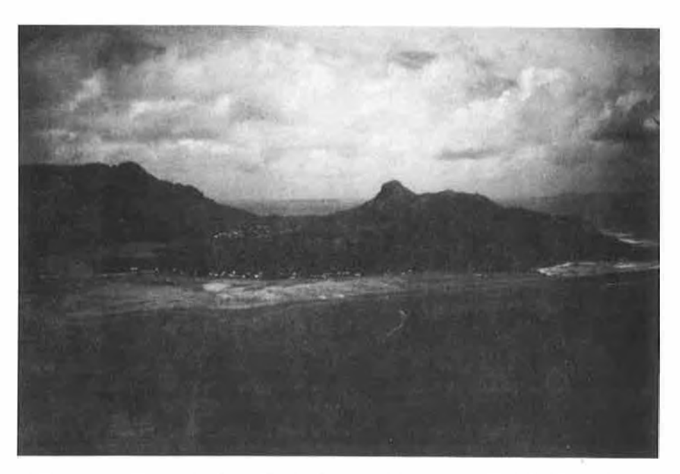
In Trukese tradition, the Tonaachaw Historic District was the location to which Sowukachaw, founder of Trukese society, came and established his meetinghouse at the beginning of Trukese history. The mountain, in what is now the Federated States of Micronesia, is a powerful landmark in the traditions of the area.