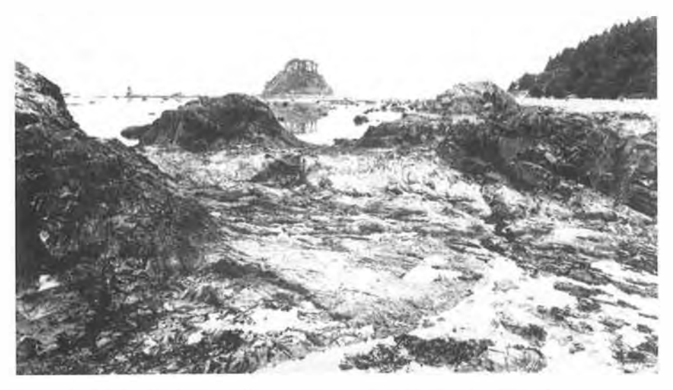
Cannonball Island, off Cape Alava on the coast of Washington State, is a traditional cultural property of importance to the Makah Indian people. It was used in the past, and is still used today, as a navigation marker for Makah fishermen, who established locations at sea by triangulation from this and other landmarks. It also was a lookout point for seal and whale hunters and for war parties, a burial site, and a kennel for dogs raised for their fur. (Makah Cultural and Research Center Archives)