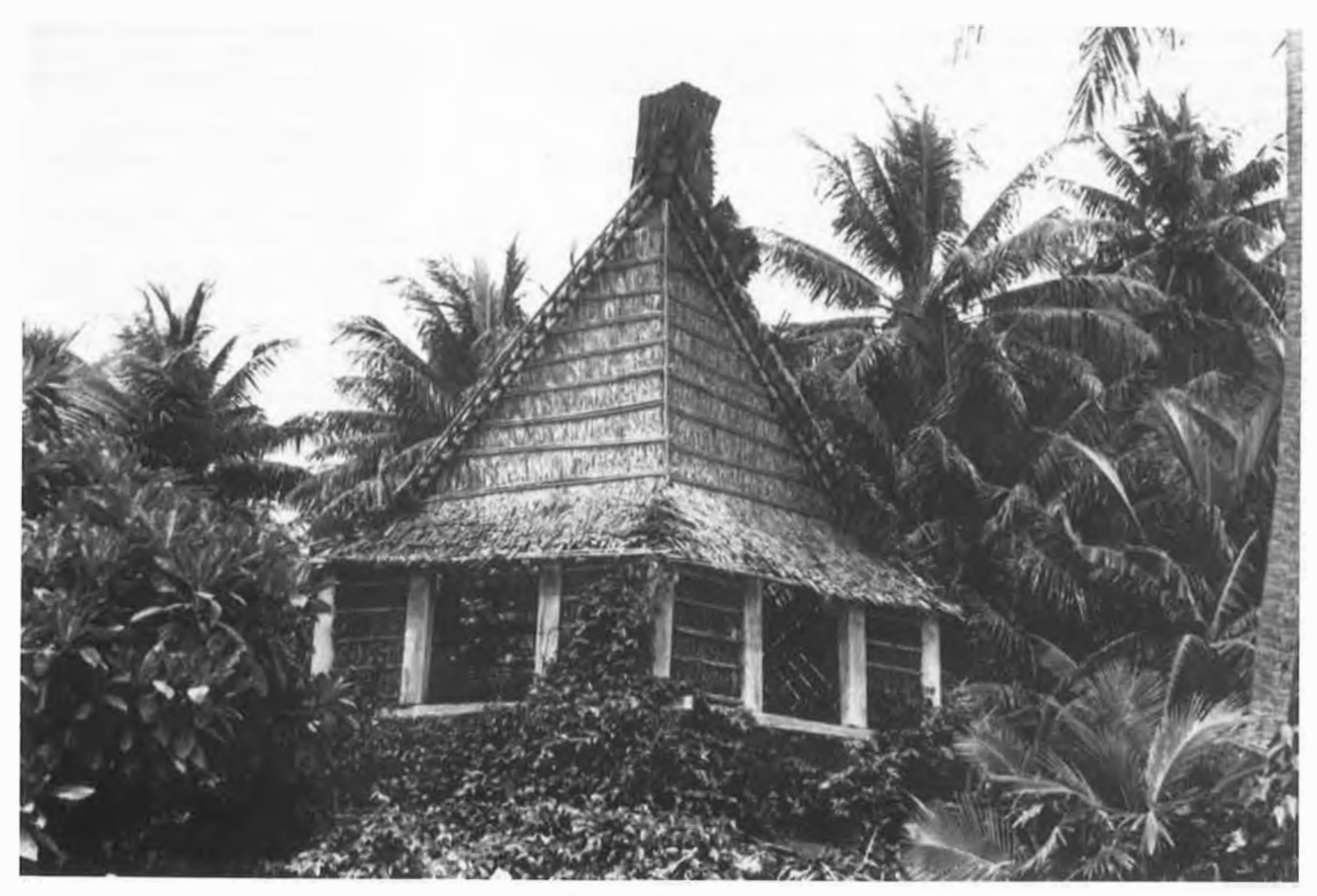
Individual structures can have traditional cultural significance, like this Yapese men's house, used by Yapese today in the conduct of deliberations on matters of cultural importance.

In defining boundaries, the traditional uses to which the property is