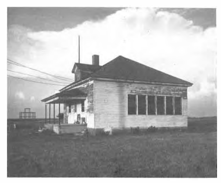
Numerous black people left the South to migrate to the Midwest. The A.M.E. Church (on the left) and District No. 1 School remain in Nicodemus Historic District in Nicodemus, Kansas, which was declared a National Historic Landmark by the Secretary of the Interior in 1976.